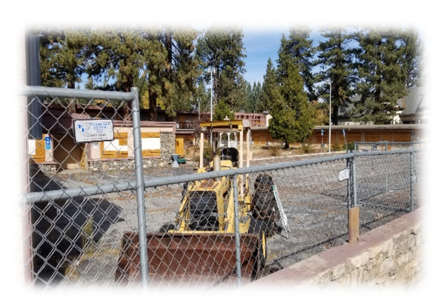
Sunray Motel example

E: jinkensforslt@gmail.com www.jinkensforslt.com (Website live soon!)